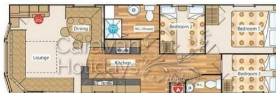
ABI Horizon - 3 bedroom